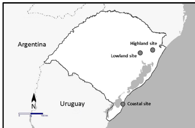
Fig. 2. Geographic location of the sampling sites.

The artificial models remained exposed in the field for 48 hours. During this time, they were inspected twice, after 24 and 48 hours since the installation. During the inspections, we recorded the presence of attack marks on the models. Each artificial model that clearly showed marks of bird attack (e.g., peck-